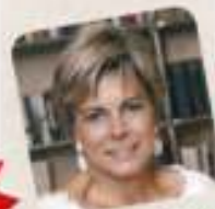
Princess Laurentien van Oranje Strategist, activist and author. As Unesco's Special Envoy on Literacy for Development and Founder and Chair, Missing Chapter Foundation, literacy and sustainability are two of the many causes she champions.

Buy 1 or 2-Day passes for the whole day (with exceptions) www.urbtix.hk - Tel: 2314 4228