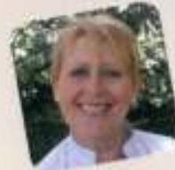
Mem Fox Influential international consultant in literacy and Australia's most highly regarded picture-book author. Her book Time for Bed is on Oprah's list of the 20 best children's books of all time.