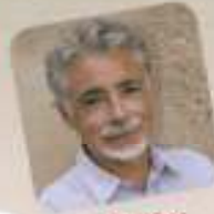
Eoin Colfer Author of the internationally bestselling Artemis Fowl series.

Buy tickets for individual sessions www.cityline.com - Tel: 2111 5333