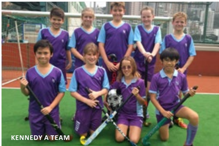
KENNEDY A TEAM

The Kennedy Hockey teams were also in action this week at the Hong Kong Primary Mixed Hockey Tournament. The A team went unbeaten during the group stages but two scoreless draws proved costly as it meant the team faced the mighty GSIS A team in the semi final. This GSIS team has won 7 out of 9 club tournaments this year so our team can be extremely proud of giving them a game and a mighty scare in the first half before conceding two late goals to which gave GSIS the win. The B team enjoyed a good learning experience which will set them up for continuing their hockey education at WIS.